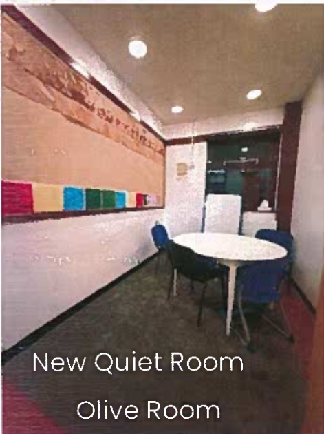
New Quiet Room Olive Room