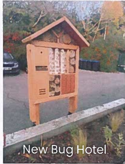
New Bug Hotel